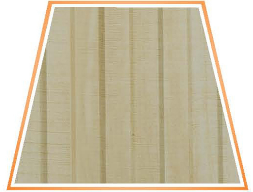
R-910 (5 Groove)