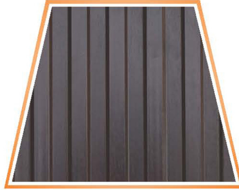
R-908 (5 Groove)