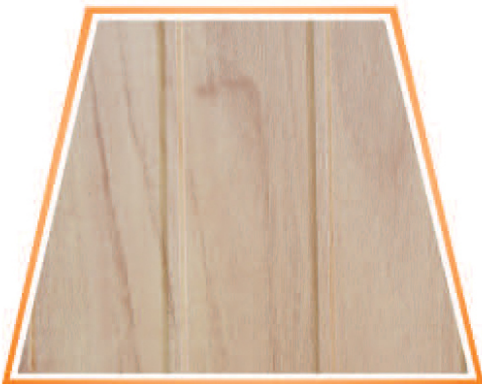
R-905 (10" 2 Groove)