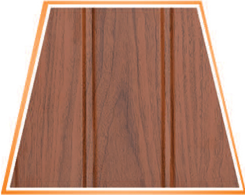
R-918 (10" 2 Groove)