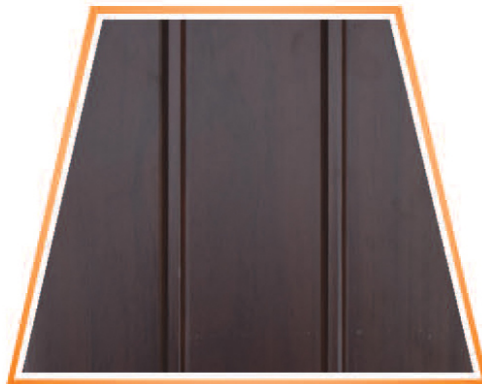
R-906 (10" 2 Groove)