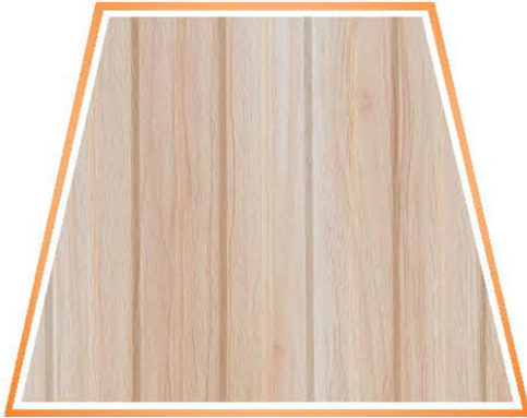
R-907 (5 Groove)