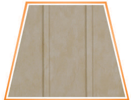
R-912 (10" 2 Groove)