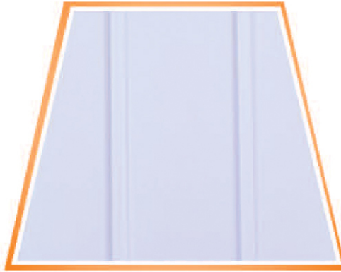
R-915 (10" 2 Groove) (White Leather)