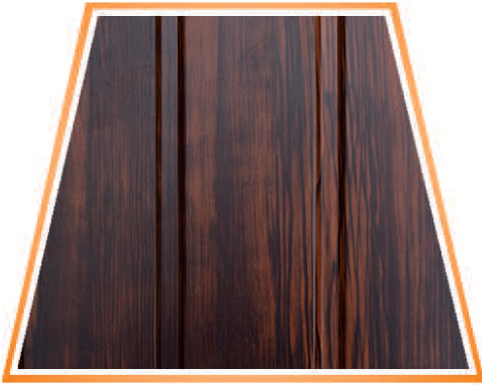
R-914 (10" 2 Groove)