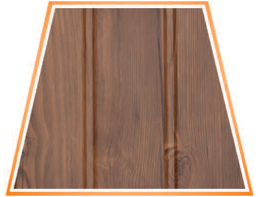
R-917 (10" 2 Groove)