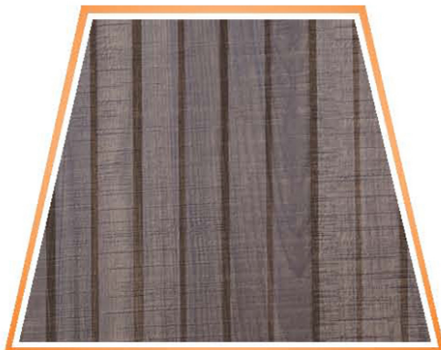
R-911 (5 Groove)